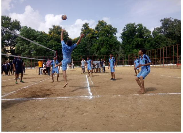
Inter Collegiate Volley ball Tournament