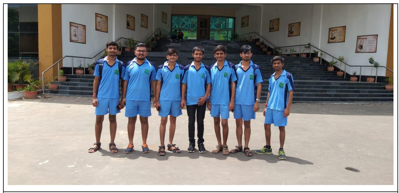
Inter Collegiate Table-tennis Tournament

participated in Inter Collegiate Table-tennis Tournament organized at FPT & BE, AAU, Anand on 06-07/09/2018.