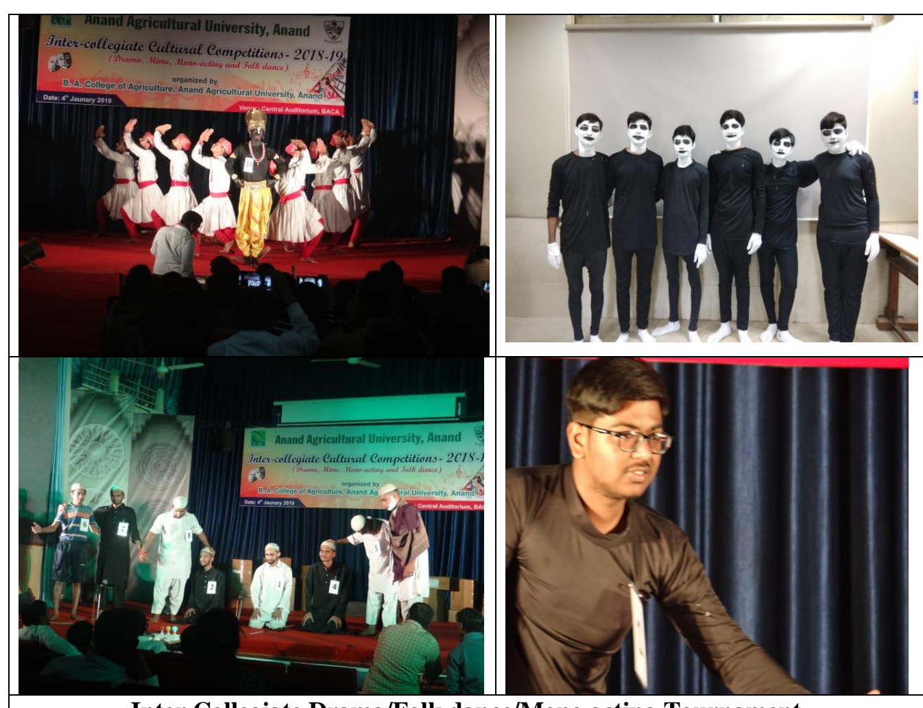
Inter Collegiate Drama/Folk dance/Mono acting Tournament