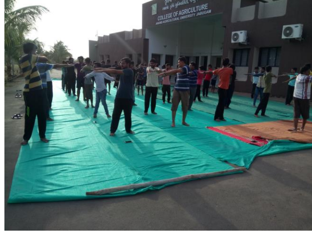
"International Yoga Day"