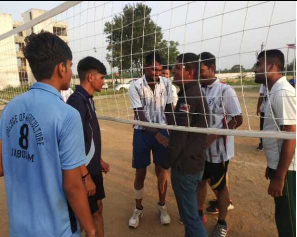
"Khel Mahakumbha- 2018"