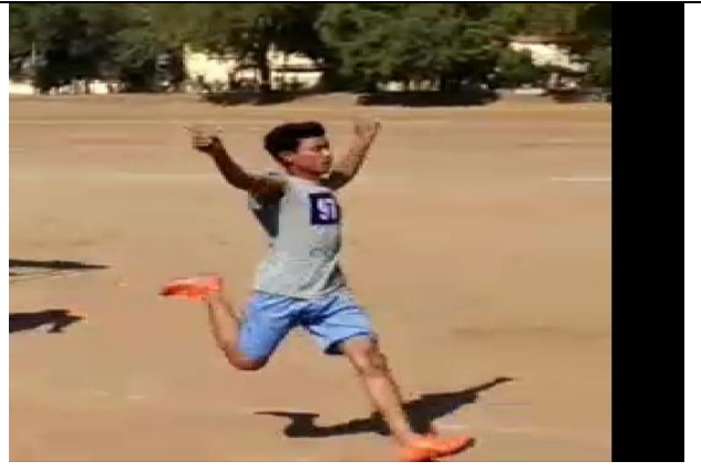
Inter Collegiate Athletics Tournament